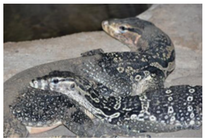
Fig. 2. Two V. salvator at CRARC that were captured at the localities of Reus and Sabadell, respectively.