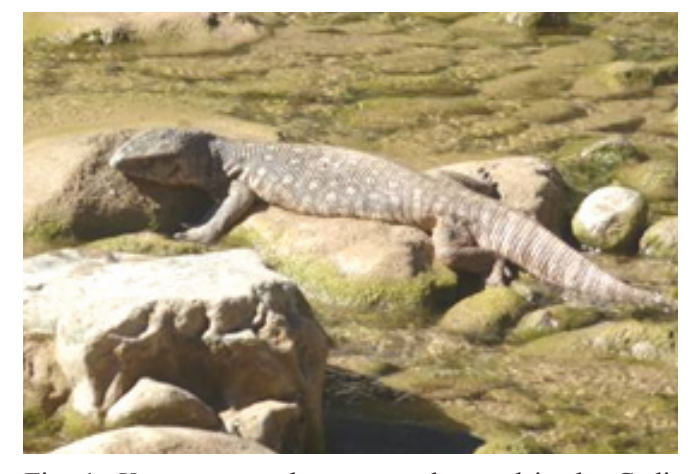
Fig. 1. Varanus exanthematicus observed in the Cadi-Moixero Natural Park (El Grasolet).

With 4,500 living specimens exported from Ghana, Benin and Togo to Spain between 2001 and 2011 (CITES Trade Database, 2012), V. exanthematicus is one of the most popular lizard species encountered in