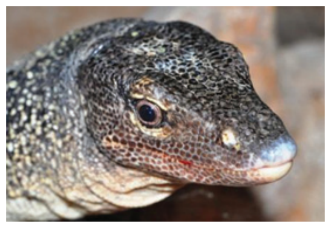
Fig. 4. Varanus juxtindicus captured at Llagostera, now in the quarantine room at CRARC.

a species which is threatened with extinction on the Iberian Peninsula and has been reintroduced to the park since 1992 (Soler et al., 2001). Varanus exanthematicus is known to prev on tortoise hatchlings (Owens et al., 2005), and may threaten this population if additional monitors are present or arrive in the future. Due to its close proximity to residential areas with reptile keepers. Ebro Delta Natural Park is another setting in Catalonia where free-ranging monitors could threaten the survival of rare indigenous species. Potentially vulnerable wildlife in this park include one of the last remaining European colonies of Audouin's Gull (Larus audouinii) (Martínez-Vilalta, 1994) as well as an additional reintroduced, and well-established population of T. h. hermanni (Bertolero, 1991). While these scenarios remain speculative for now, the fact that several large monitor species have been able to survive in Catalonia under the Mediterranean climate and natural conditions of its coastal zone where they may prey on threatened indigenous species, demonstrates a risk which will need to be evaluated.